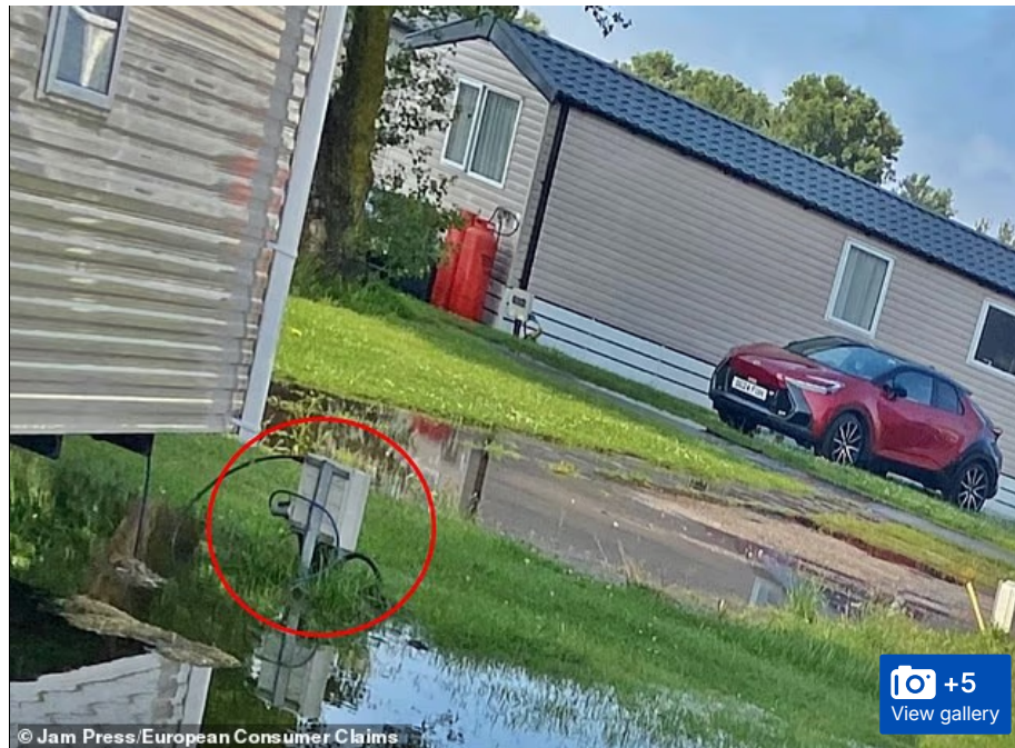
The couple's electricity meter becomes immersed in water, according to the couple

'[In our opinion], it's clearly dangerous, especially when the electric meter is immersed in deep water.'